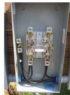
Item G: Meter Socket